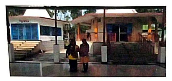
FIG: KALIBARI TEMPLE