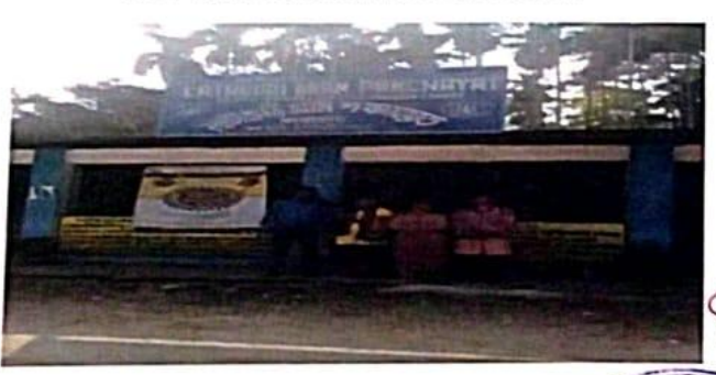
FIG: LATAGURI GRAM PANCHAYA