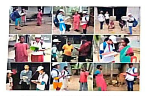
FIG: HOUSEHOLD SURVEY