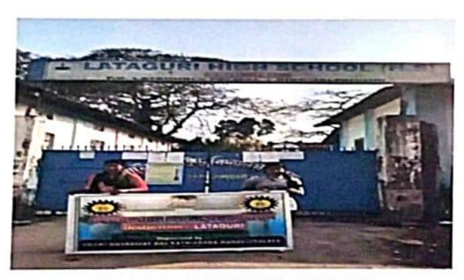
FIG: LATAGURI HIGH SCHOOL