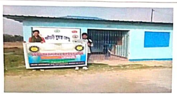
FIG: LATAGURI HEALTH CENTER