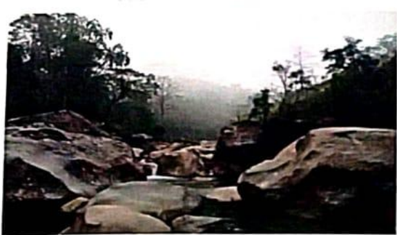
FIG: ROCK ISLAND