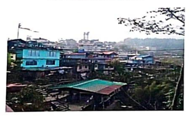
FIG: HOUSE TYPE