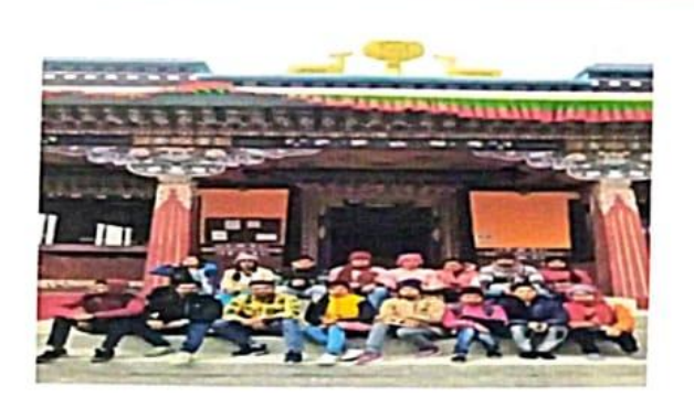
FIG: BUDDHA TEMPLE